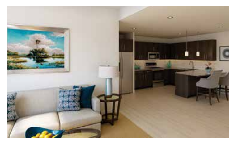
A Club Independent Living Residence

The Villages of Windsor Assisted living is elevated to a new level of sophistication and convenience. Residents who need assistance with the activities of daily living can relax in comfortable, sunlit apartment homes knowing a helping hand is nearby when needed. With the assurance of such exemplary surroundings, you can live each day with confidence, ready to begin or rekindle your interest or curiosity for all that is possible.