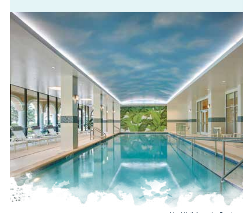
LiveWell Aquatic Center

You want to feel your best. After all, there's so much to do! At Windsor at Celebration, fun and vitality just naturally go together, for a true culture of lifelong wellness. Live your best life possible now!