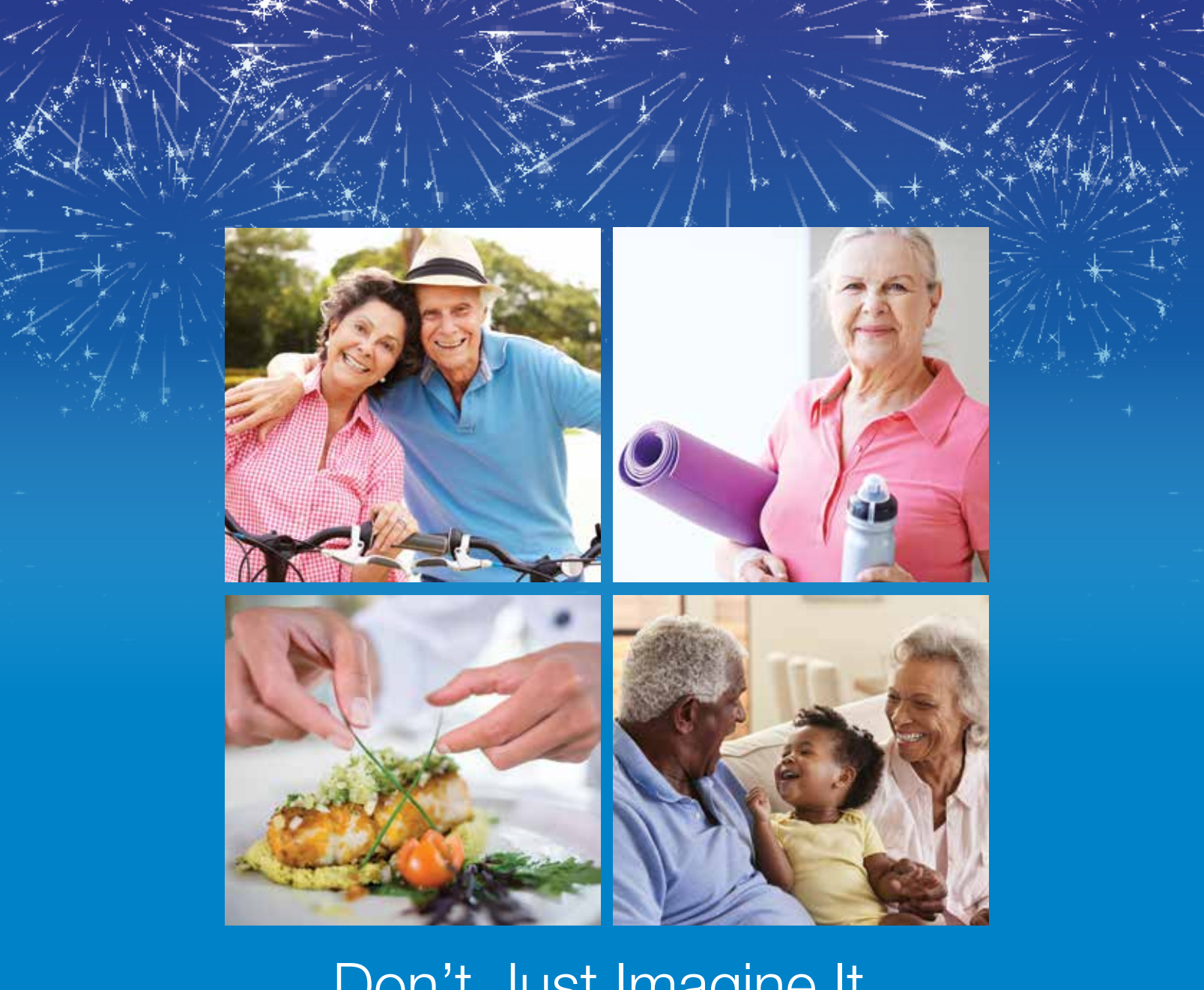
Don't Just Imagine It, Celebrate It!