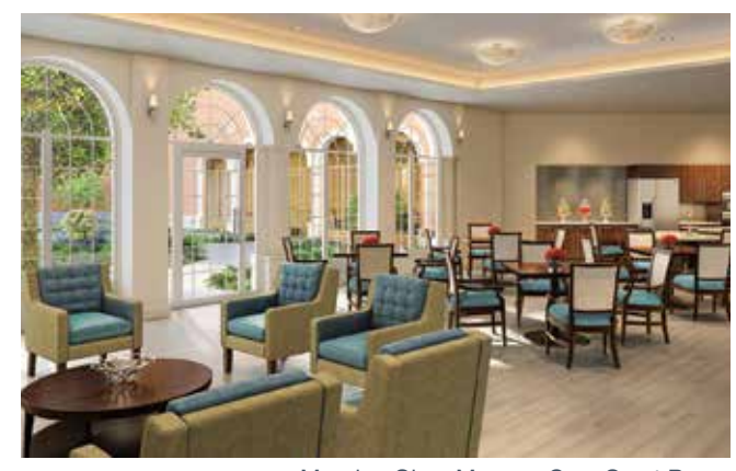
Morning Glory Memory Care Great Room