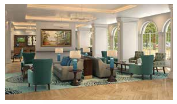
The Grand Lounge