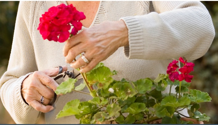
At the Neighborhoods of Windsor at Celebration, we incorporate the three key components of active daily living.

Individuals with memory loss often experience agitation or frustration if they don't have balance in their lives. Subconsciously we all require three things to lead a balanced and active daily life. For residents with memory loss, incorporating specific routines in a familiar environment minimizes anxiety.